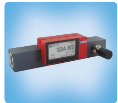
VGR-G½ mass flow meter