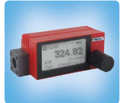
VGR-G¼ mass flow meter with manual control valve